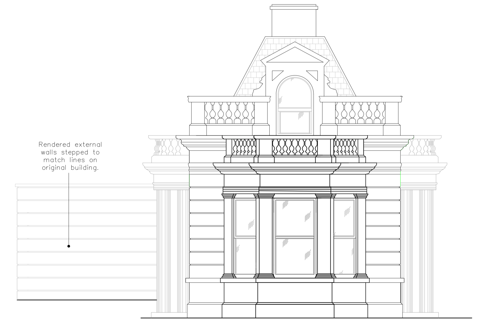
Proposed side (south) elevation Scale 1:50

Rendered external walls stepped to match lines on original building.