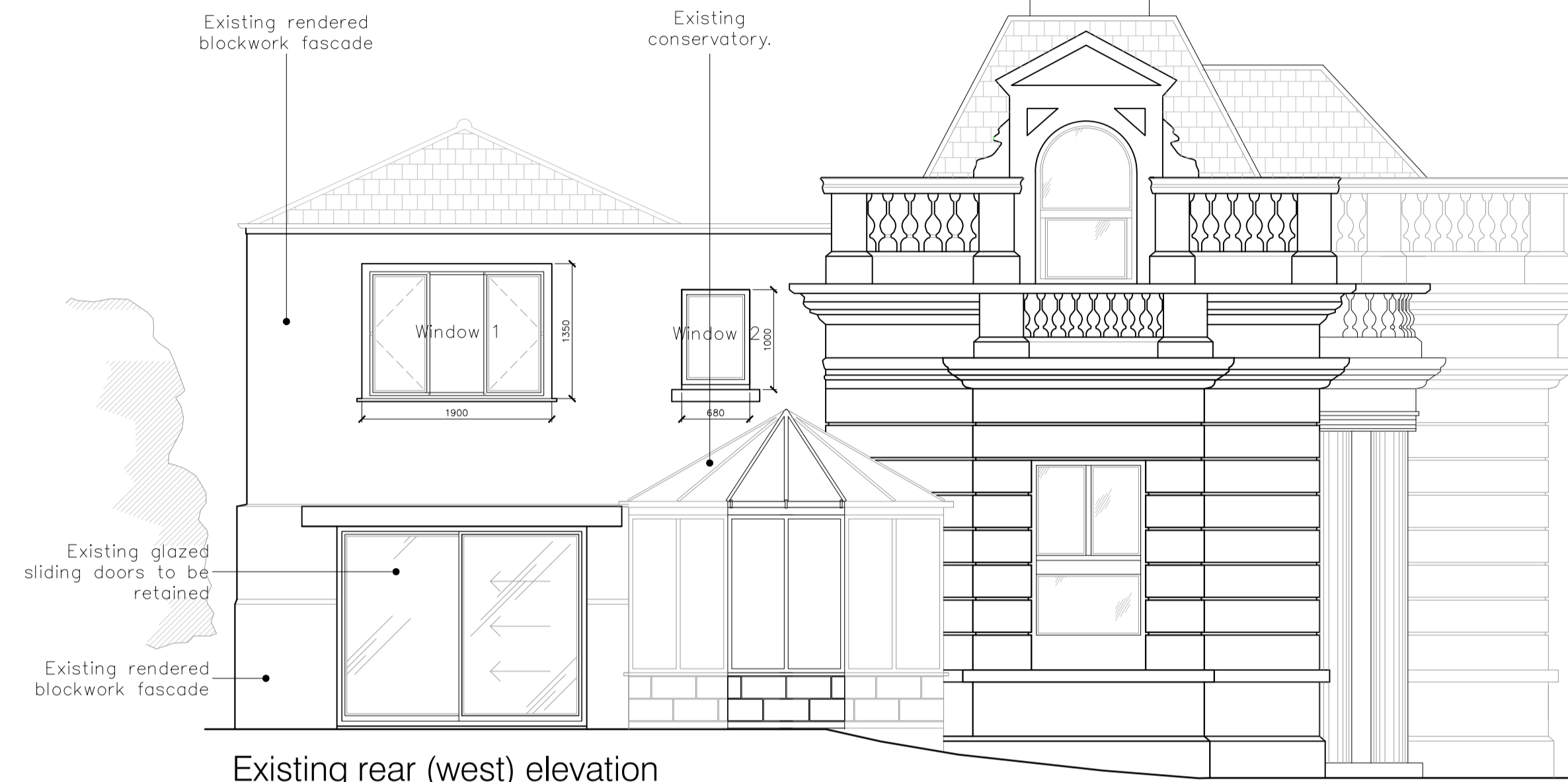
Existing rear (west) elevation Scale 1:50