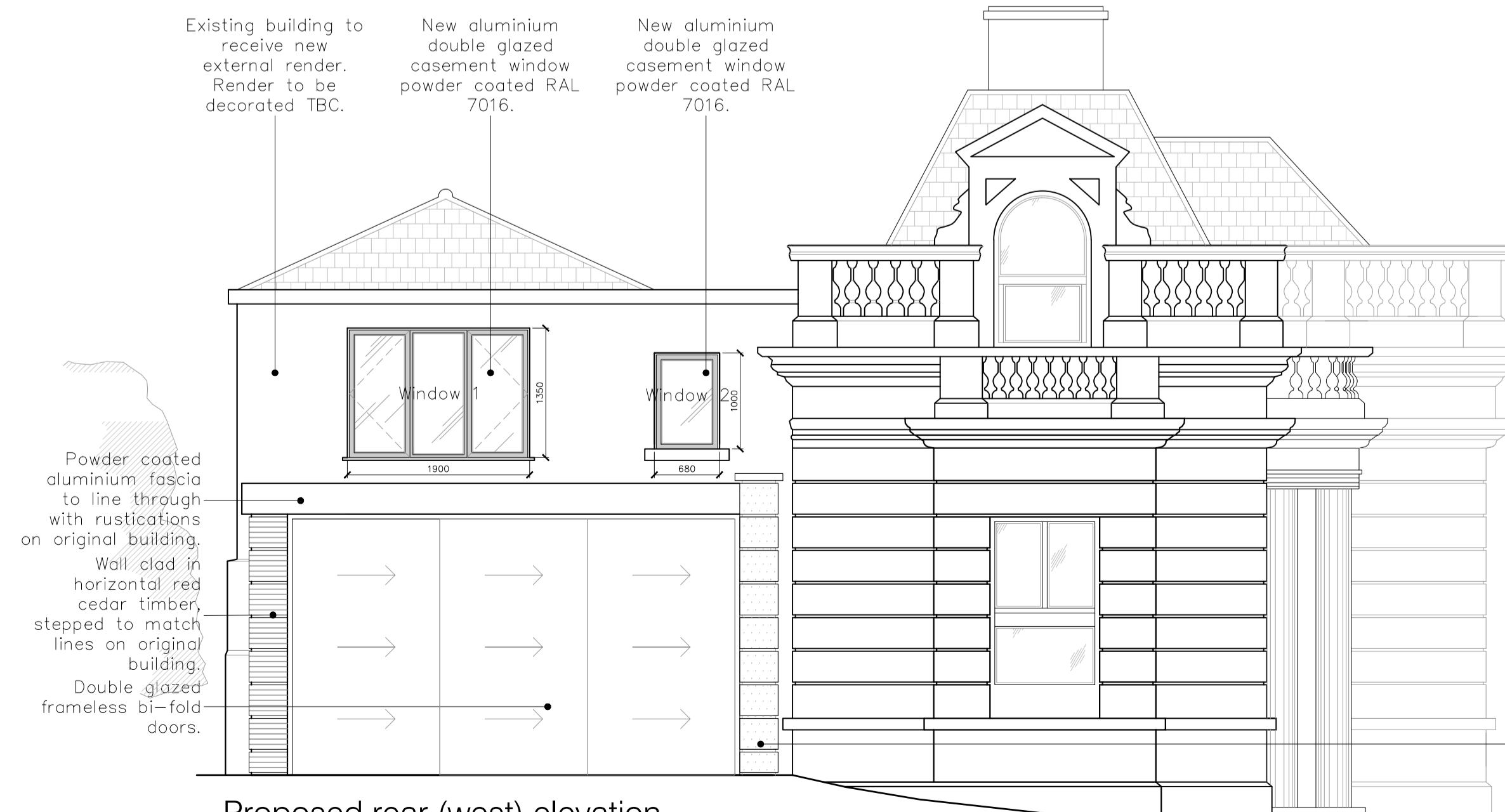
Proposed rear (west) elevation Scale 1:50