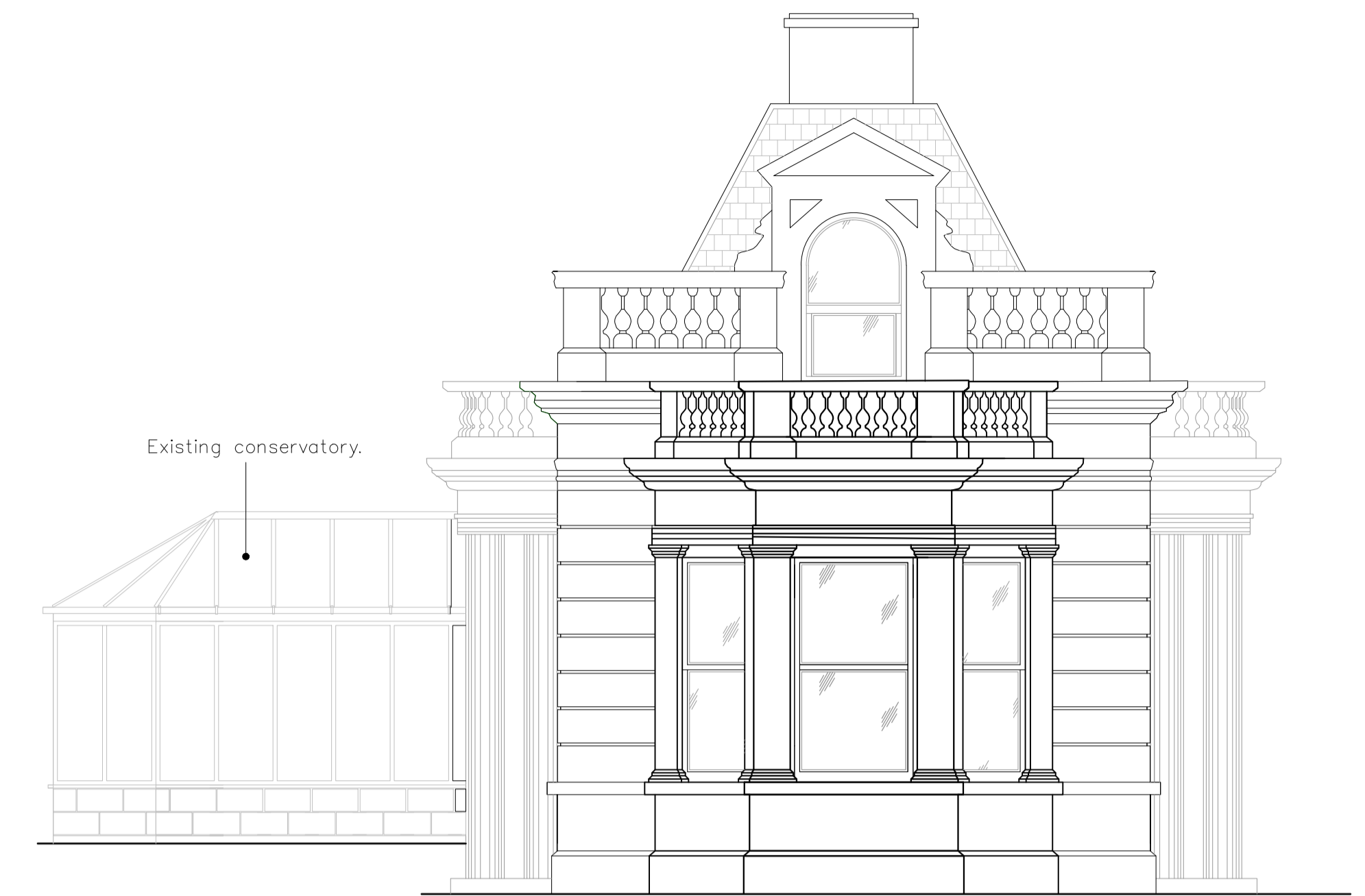
Existing side (south) elevation Scale 1:50